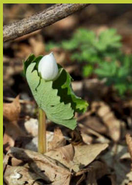
Bloodroot flower emerges from leaf mulch.

Limited space is available for current WOTC members. Please register online: Wild Ones Twin Cities: Calendar .