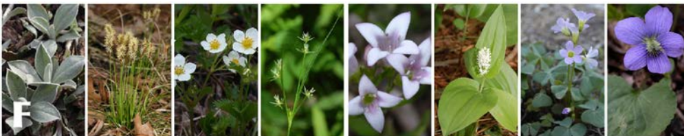
Living mulch plants from the 2022 plant sale collection called "Born to Mingle."

Living mulch is using plants to fill spaces between other plants. Plants typically used for living mulch are short, spreading ground cover that occupies the lowest herbaceous niche in a garden, a niche that is often occupied by abiotic (wood, rock) mulches in more traditional garden design.