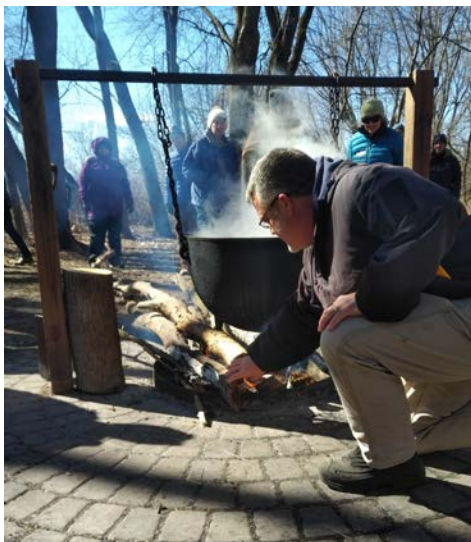
Maple syrup cauldron at Dodge Nature Center.