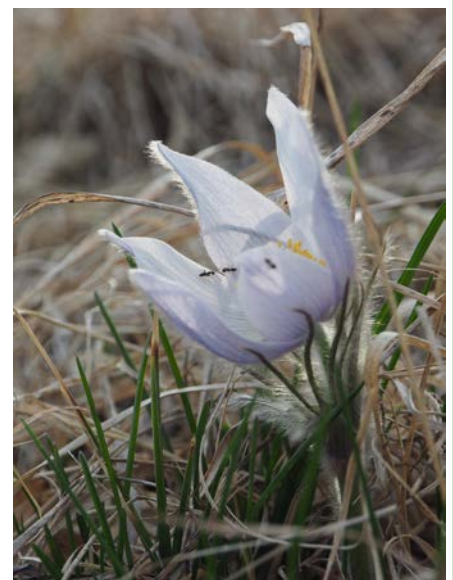
Pasque flower blooming on the spring prairie.

– Robin Wall Kimmerer, Braiding Sweetgrass