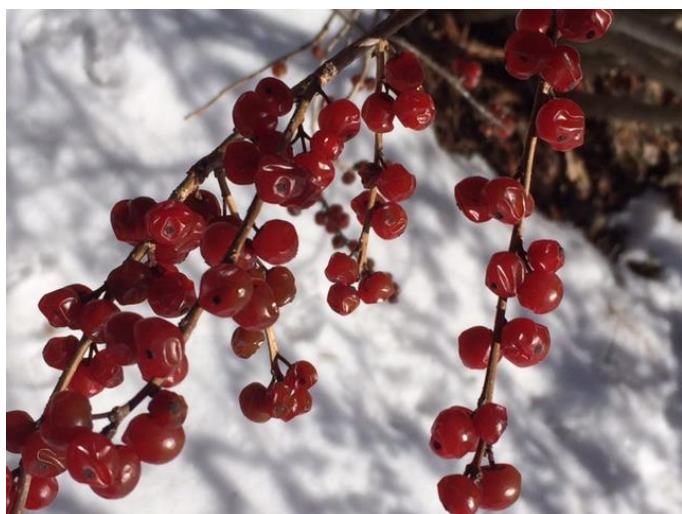
Winter wonder! Common winterberry holly ( Ilex verticillata )