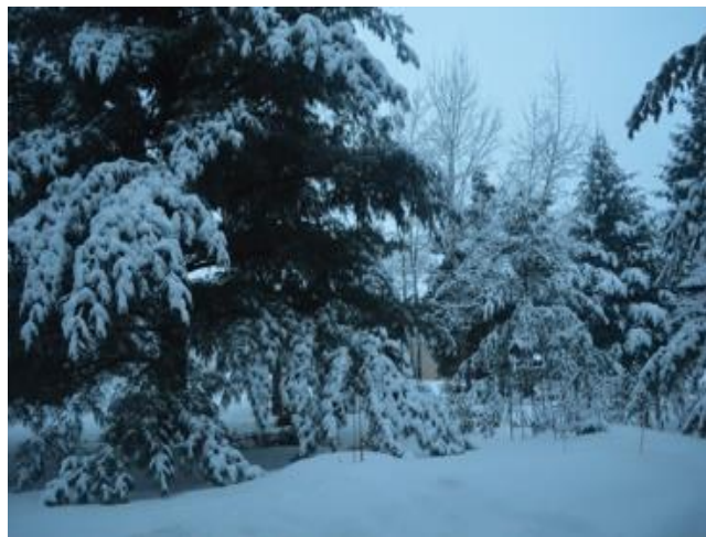
Winter layers. Shelter for birds.