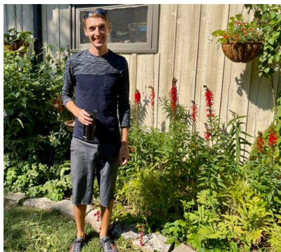
Our popular "Living Mulch" collection of native groundcover plants available at our 2021 plant sale — June 4th

It's been a busy summer! Native garden tours returned this year, giving us a chance to meet old friends and greet new ones, and our native plant sale was a success!