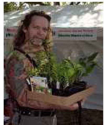
Happy plant buyer - Photo by Vicki Bonk

People are motivated to act! The Vagary Native Plant Nursery sold all of the native plants they brought in for the festival. Project for Art in Nature offered a prairie safari in the Lakeside garden that was an adventure for many urban kids. Next year, the Naturescape gardeners will make some improvements to garden with the kids in mind. Experiencing the wonder