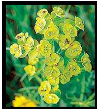
Leafy Spurge