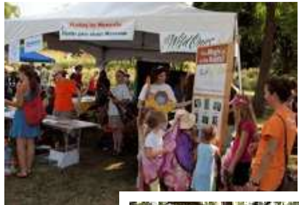
Monarch Festival day - Photo by Vicki Bonk

Daily Planet: Monarchs reign over Lake Nokomis celebration shares photos.