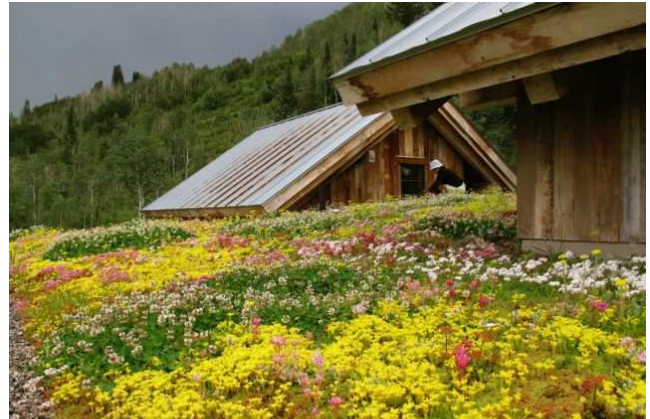
Amazing roof garden