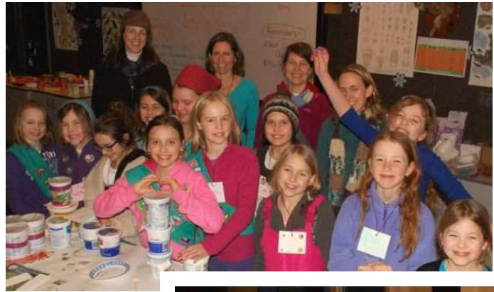
Girl Scout Troop attendees

10. Continue to watch over the newly planted seedlings while they take root in your garden.