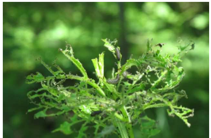
Caterpillar Destroyers

It was stressed that we humans are a part of nature and as such we should be fully engaging with it. There is great joy to be derived in interacting with nature and not just observing from afar. Our very naming of processes and movements we can join: restoration, ecology, permaculture, biodynamics to name a few seems to put these actions outside of ourselves and to separate us from nature. That is, we are not really thinking of ourselves as a part of the natural process in any positive way. We should relax and allow ourselves to be open to the world around us and to receive it with joy.