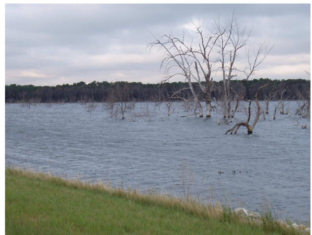
Flood waters in 2007