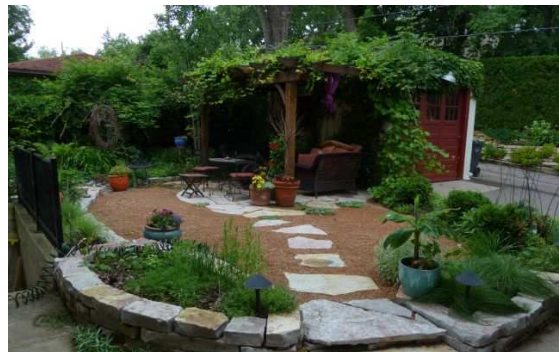
Rain garden designed by Douglas Owens Pike