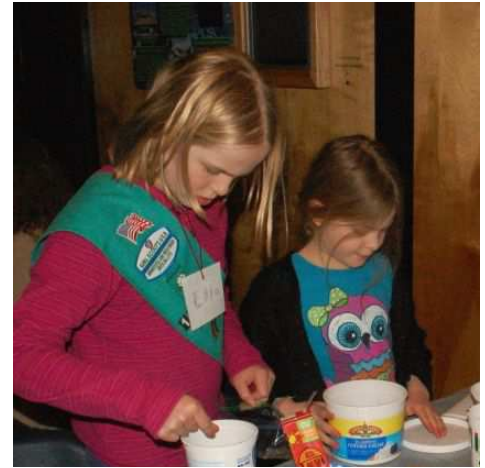
Troop members in action